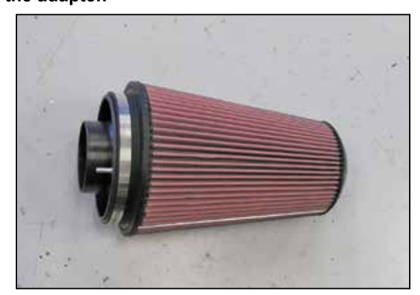
14. Install the adapter assembly into the K&N<sup>®</sup> air filter and secure with the provided hose clamp.

NOTE: Be sure to add a drop of the provided thread locker to each stud before installing into the adapter.