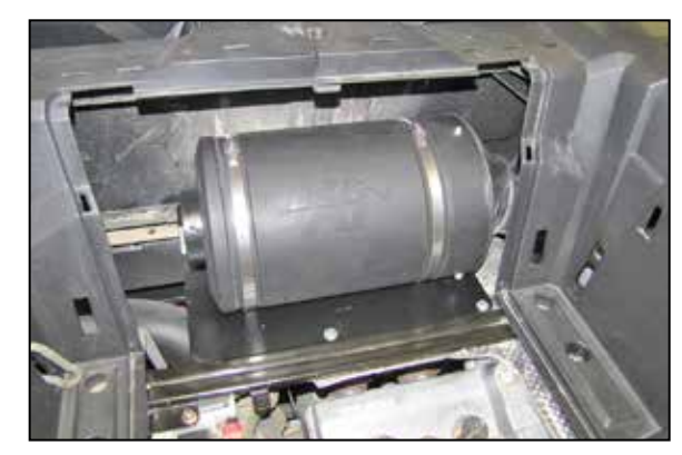
17. Install the filter canister assembly onto the mounting tray and connect the fresh air inlet hose. Adjust the canister and hose for best fit and then secure the canister and hose with the hose clamps. NOTE: Due to differences in the production factory foil heat shield, the heat shield may need to be reformed to allow the canister and fresh air hose to fit together.