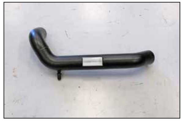
21. Install the provided vent fitting into the K&N® intake tube.

NOTE: NPT fitting has tapered threads and only designed to be installed until hand tight, then tighten one rotation or when the fitting becomes difficult to return.