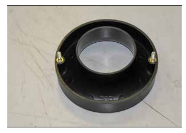
13. Install the two provided 6mm studs into the radius filter adapter as shown.

NOTE: the two upper air filter housing bolts will not be reused and the locations left blank.