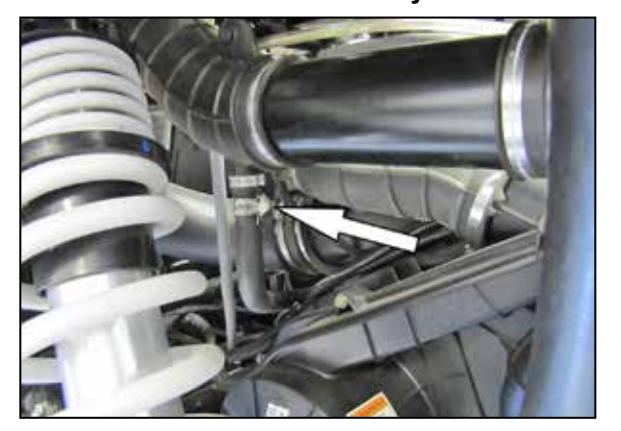
7. Loosen the clamp securing the vent hose to the intake tube.