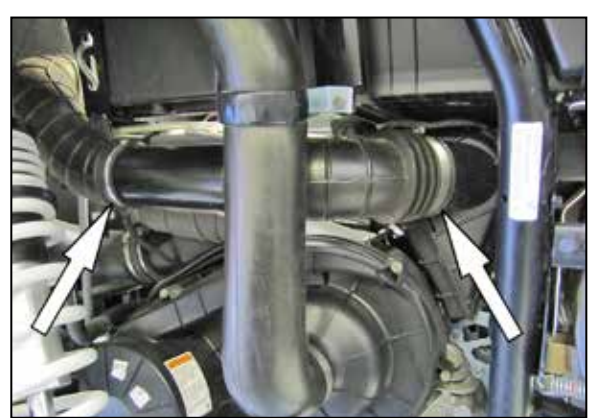
8. Loosen the hose clamp at the plenum and remove the bolt securing the intake tube. Then remove the intake tube from the vehicle.