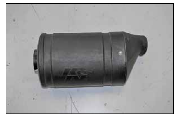
16. Install the end cap into the canister and secure with the provided hardware.