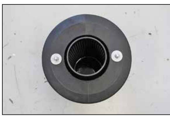
15. Install the filter assembly into the K&N® filter canister and secure with the provided hardware.