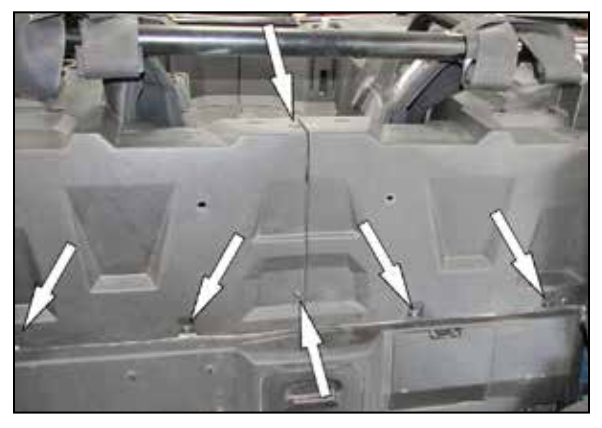
12. Reinstall six of the eight bolts removed in step #2. Reinstall the seats.

NOTE: the two upper air filter housing bolts will not be reused and the locations left blank.