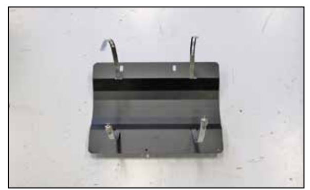
10. Install the two provided large hose clamps through the filter base plate as shown.