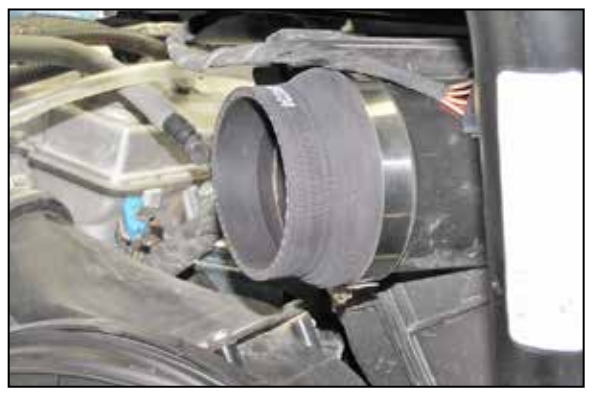
19. Install the provided coupler hose (084034) onto the factory intake plenum and secure with the provided hose clamp.