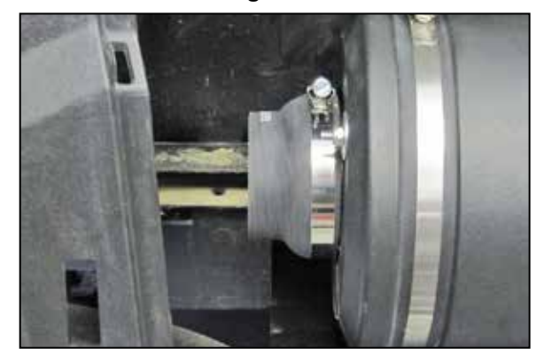
18. Install the provided coupler hose (084093) onto the filter adapter and secure with the provided hose clamp.