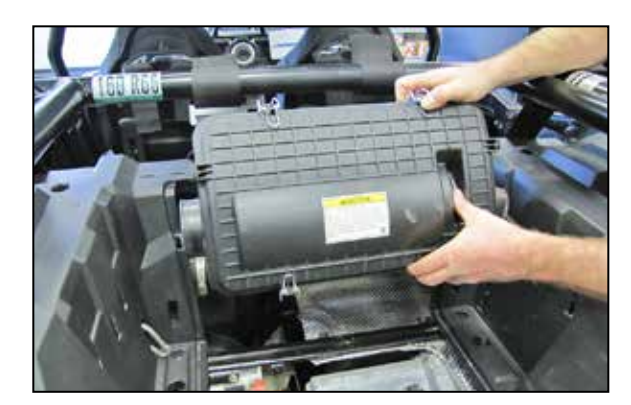
6. Remove the air filter housing from the vehicle. NOTE: K&N Engineering, Inc., recommends that customers do not discard factory air intake.