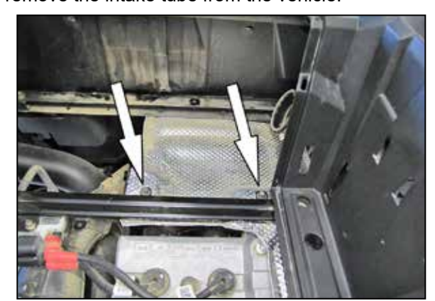
9. Remove the two nuts and bolts shown that secure the heat shielding to the chassis.