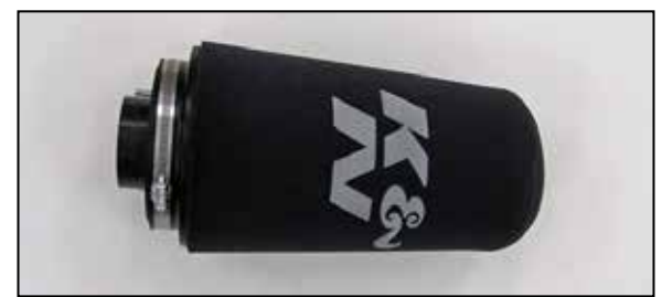
14a. Install the provided foam wrap onto the K&N ^{\!\otimes} air filter.