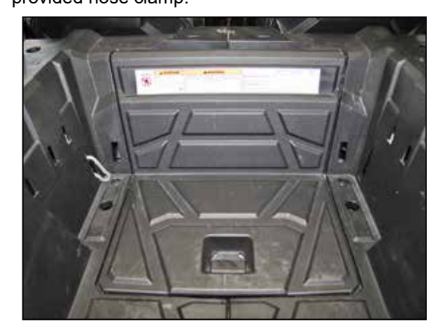
20. Reinstall the factory engine cover.