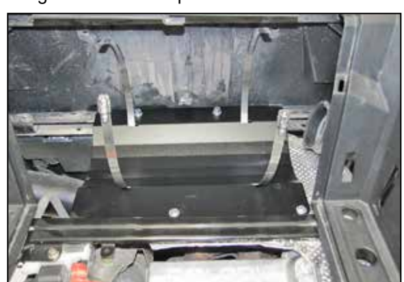
11. Install the filter base plate assembly as shown using the provided hardware.